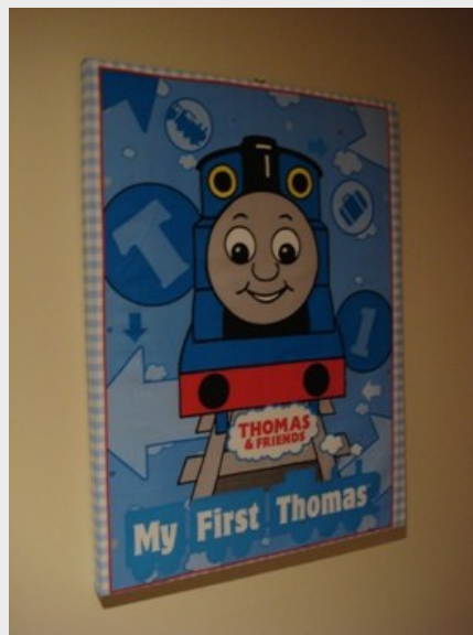
The large canvases are 30 x 40 inch (76cm x 102cm) and 1.5 inch deep (3.8cm)